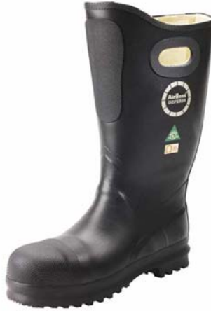
AIRBOSS CBRN THE BOSS FIRE BOOT - 20% LIGHTER THAN AVERAGE -

We invite you try out a pair of the BOSS boots at your local equipment dealer.