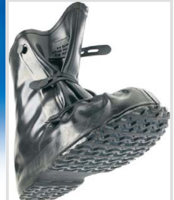
AIRBOSS CBRN LIGHTWEIGHT OVERBOOT (ALO)