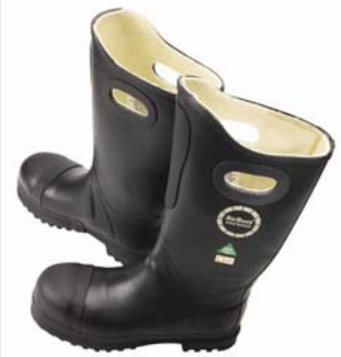
AIRBOSS CBRN THE BOSS FIRE BOOT

AirBoss-Defense provides a full line of CBRN PPE, including the BOSS, the only fire boot certified by UL as a stand alone product to comply with NFPA 1994 for CBRN protection.