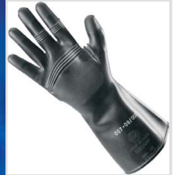
AIRBOSS CBRN MOULDED GLOVE (AMG)